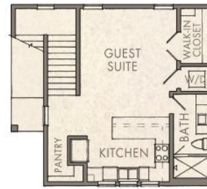
SECOND FLOOR (Carriage House)